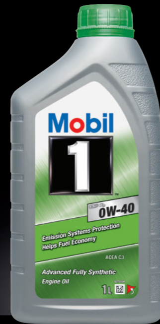
Mobil 1™ ESP x3 0W-40 The first lubricant to receive Porsche C40 approval!

*Disclaimer: according to VW PV1496 fuel efficiency test