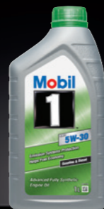
Mobil 1™ ESP 5W-30