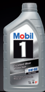
Mobil 1™ FS x1 5W-50