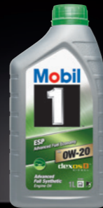
Mobil 1™ ESP x2 0W-20