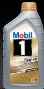
Mobil 1™ FS 0W-40