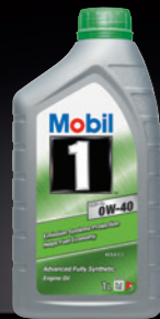
Mobil 1™ ESP x3 0W-40